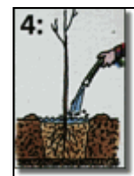
4: Shovel in the remaining soil. It should be firmly, but not tightly packed with your heel. Construct a water-holding basin around the tree. Give the tree plenty of water.

Plant the tree at the same depth it stood in the nursery, without crowding the roots. Partially fill the hole, firming the soil around the lower roots. Do not add soil amendments.