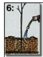
6: Water the tree generously every week or 10 days during the first year.

After the water has soaked in, place a 2-inch deep protective mulch area 3 feet in diameter around the base of the tree (but not touching the trunk).