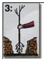
3: Plant the tree at the same depth it stood in the nursery, without crowding the roots. Partially fill the hole, firming the soil around the lower roots. Do not add soil amendments.

Remove any grass within a three-foot circular area. To aid root growth, turn soil in an area up to 3 feet in diameter.