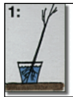
1: Unpack tree and

soak in water 3 to 6 hours. Do not plant with packing materials attached to roots, and do not allow roots to dry out.